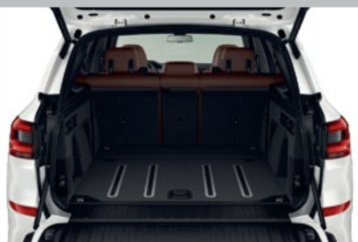
Luggage-compartment package with automated sliding and anti-slip rail, flex net and electric rolling cover with stowage in floor insert

Please refer to this insert for local market specifications.