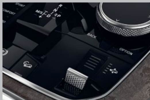
Adaptive 2-axle air suspension with automatic self-levelling suspension, selectable on five levels in total of 80mm adjustment travel