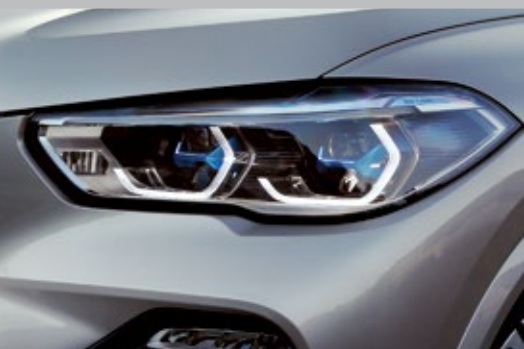
Adaptive LED headlights with BMW Laserlight incl. BMW Selective Beam

*Actual car specifications may vary from the picture shown above. Details for the options available, please speak to your authorized BMW dealer.