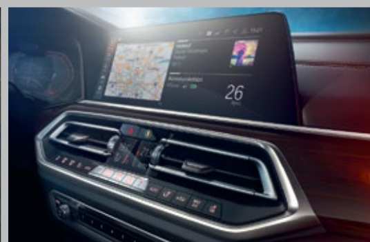
BMW Live Cockpit Professional